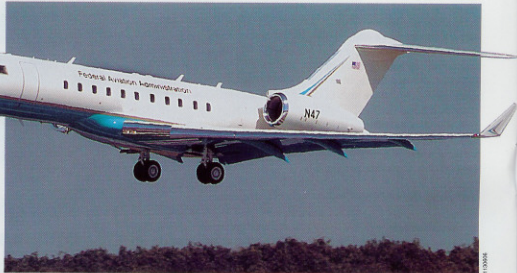
Flight tests carried out by the FAA in November 2005 demonstrated the concept of a broadband general-purpose aviation communications network.

One of the key differences between this plan and existing satellite-only broadband data systems is the fact that all the participating aircraft will act as air-to-air relays. Each will operate in a peer-to-peer relationship with other aircraft and will support the service whether or not it is